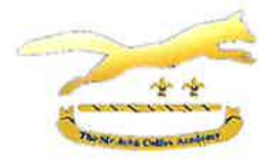
The Sir John Colfox Academy