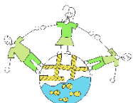
Bridport Primary School